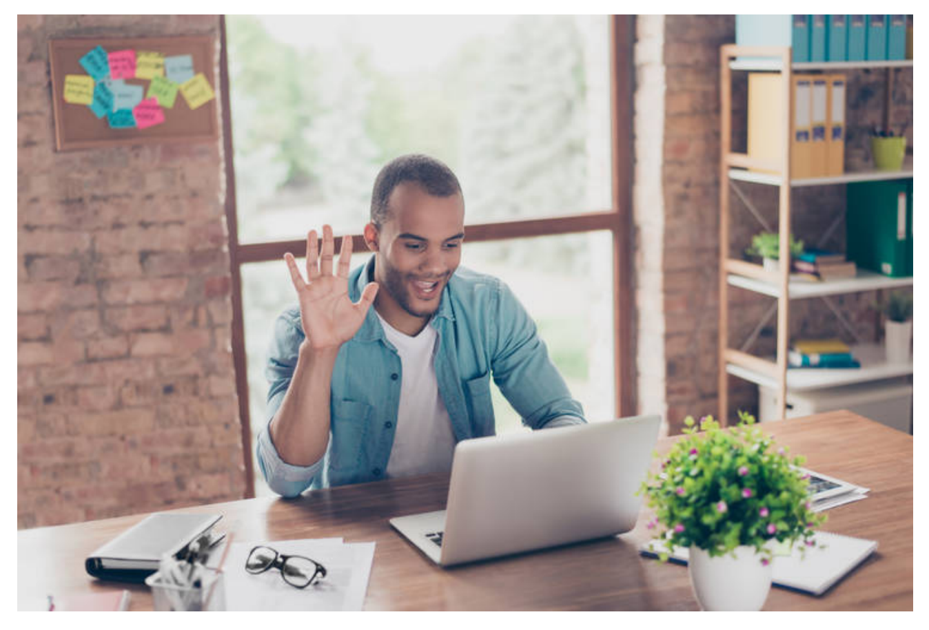
Providing virtual reflective supervision/consultation requires extra attention to forming safe and trusting relationships.

that, the group began to bond. In this meeting, I also shared a routine I tend to follow during my RS/C sessions and asked for feedback. My routine often looks like this: mindfulness moment/activity, check-ins, update from previous session's presenter, identified presenter shares their work while the group listens carefully, then time for reflection together. We all agreed on this format for our coming together, and we were on our way!